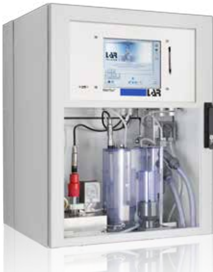
Highly sensitive bacteria in a robust analyser.

NitriTox continually checks incoming waste water for pollutants. Additionally, the reaction of highly sensitive nitrifiers to potential toxins in water is determined and that within an measurement interval of just 5 minutes.